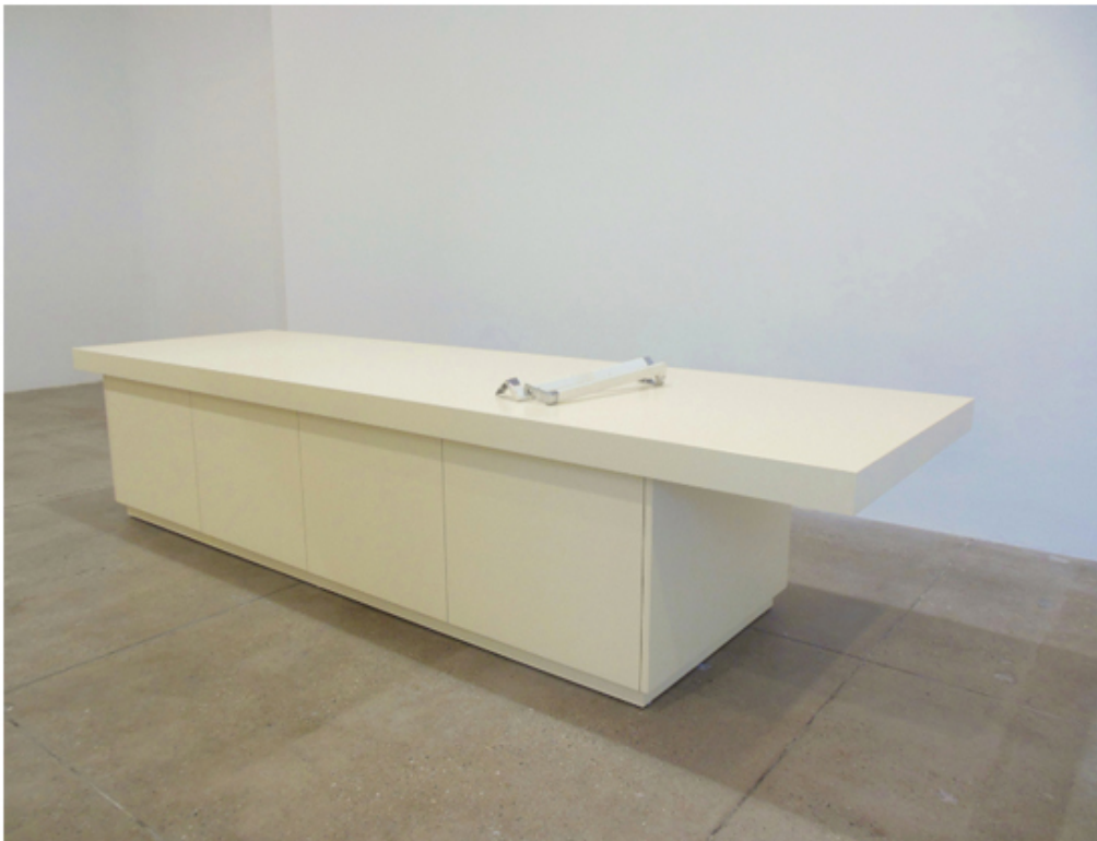
Daniel Turner, untitled, maple, mdf, polyethylene, aluminum, 26" x 28" x 108", 2013.