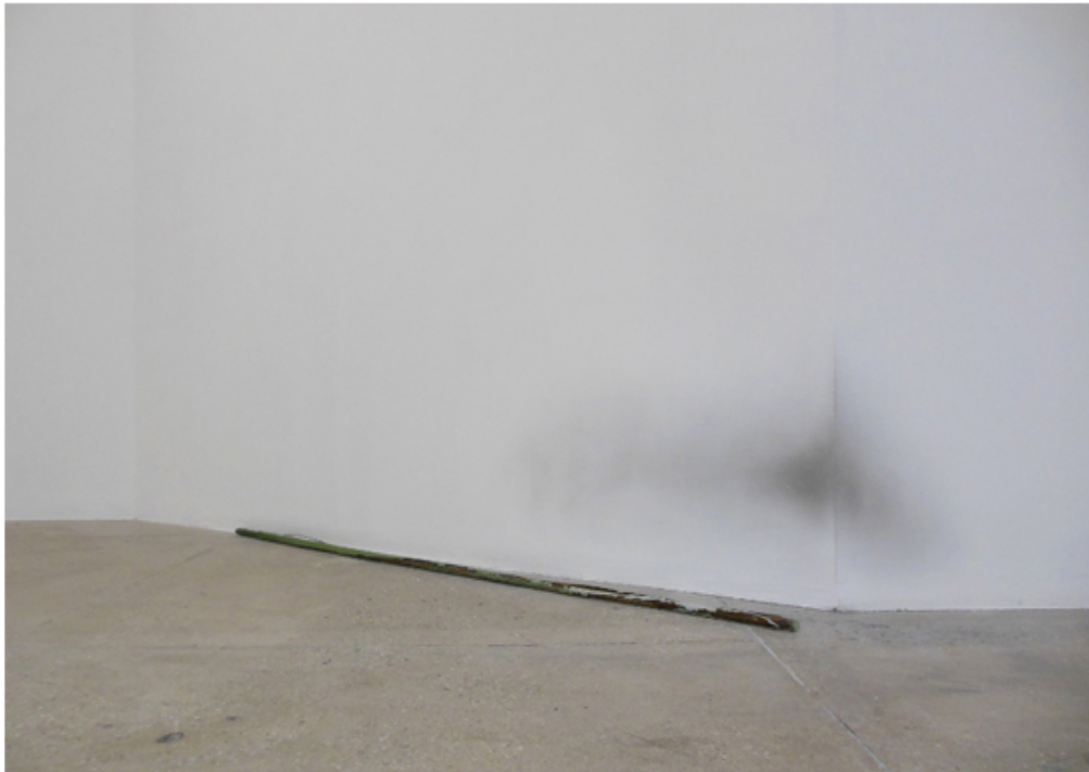
Daniel Turner, untitled, vinyl, steel, steel wool rubbing, 74" x 1", 2013.

Also in the gallery are several wall rubbings. Inspired by a previous job as a guard at the New Museum many years ago, the artist is interested in delicate traces that document presence, whether human or other. Similar to the evolving state of the chemical reaction in the basin, here is a focus on markings that function as a memory of what was.