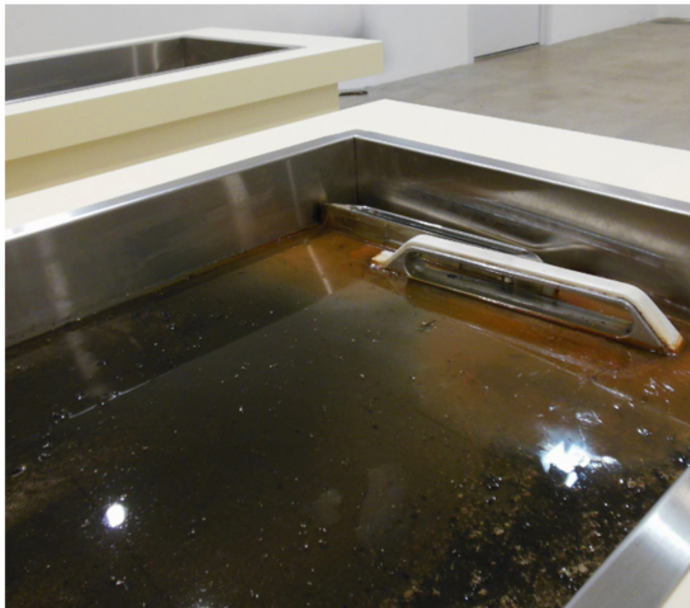
Daniel Turner, untitled , maple, mdf, stainless steel, saltwater, soil, polyethylene, aluminum, 24" x 28" x 108", 2013. (detail).