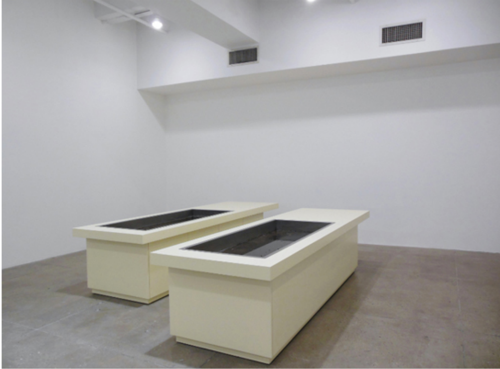
Daniel Turner, untitled, maple, mdf, stainless steel, saltwater, soil, polyethylene, aluminum, 24" x 28"x 108", 2013. (each).